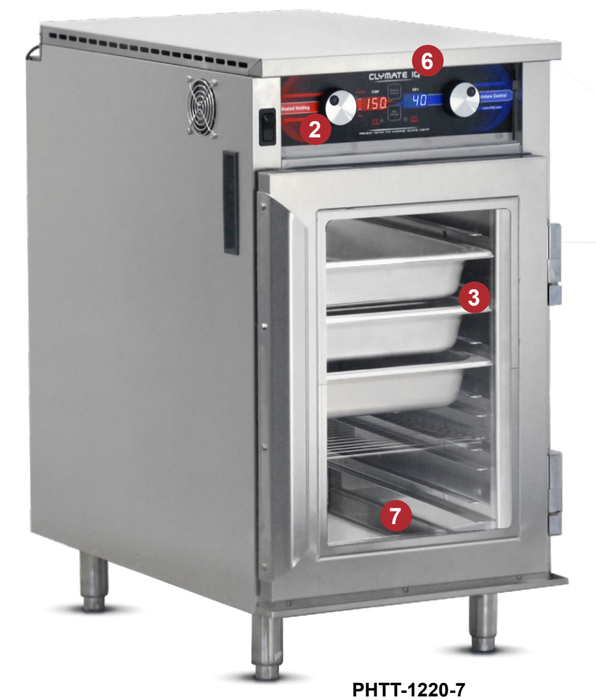
(Shown with Optional Accessory Glass Door)